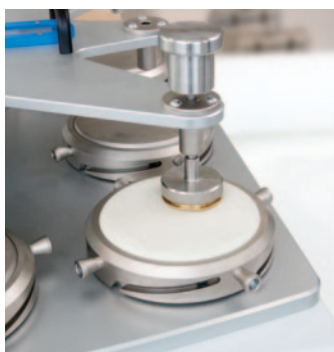
Example of 1-position sample holder with Ø 38 mm

Sample holder for ABRASION test on leather and on coated fabrics , according to UNI EN ISO 17076-2, Code 2568.260.