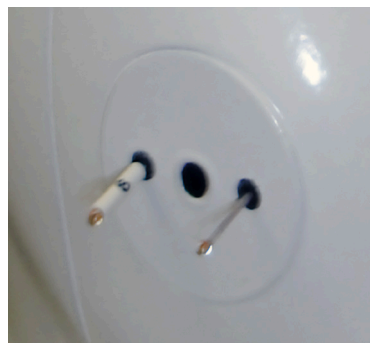
Combination temperature and windspeed sensor, with protective cap removed